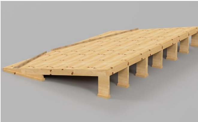
fully assembled 8ft x 12ft ramp – RK812