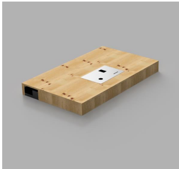
3ft x 5ft Platform - P35

Auto-Tee platforms come in two variations and require simple assembly. Customer must construct separate platforms to extend platform to desired final size. Both platforms stand 5 ¾ inches above the ground.