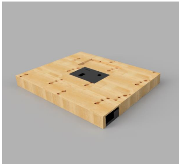
4ft x 5ft Platform with Insert Recess – P45